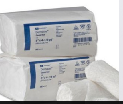
Surgical guaze; procedure packs & pharma. distribution CARDINAL HEALTH

Respiratory medications & blow-fill-seal contract manufacturing; global HQ NEPHRON PHARMACEUTICALS